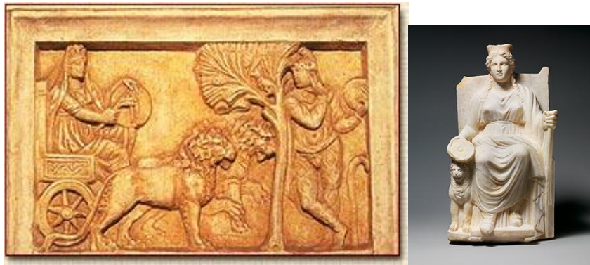
Relief of Cybele holding a gong with Attis Statue from 1 st or 2 nd century AD with Cybele holding a gong http://www.metmuseum.org/toah/works-of-art/22.139.24